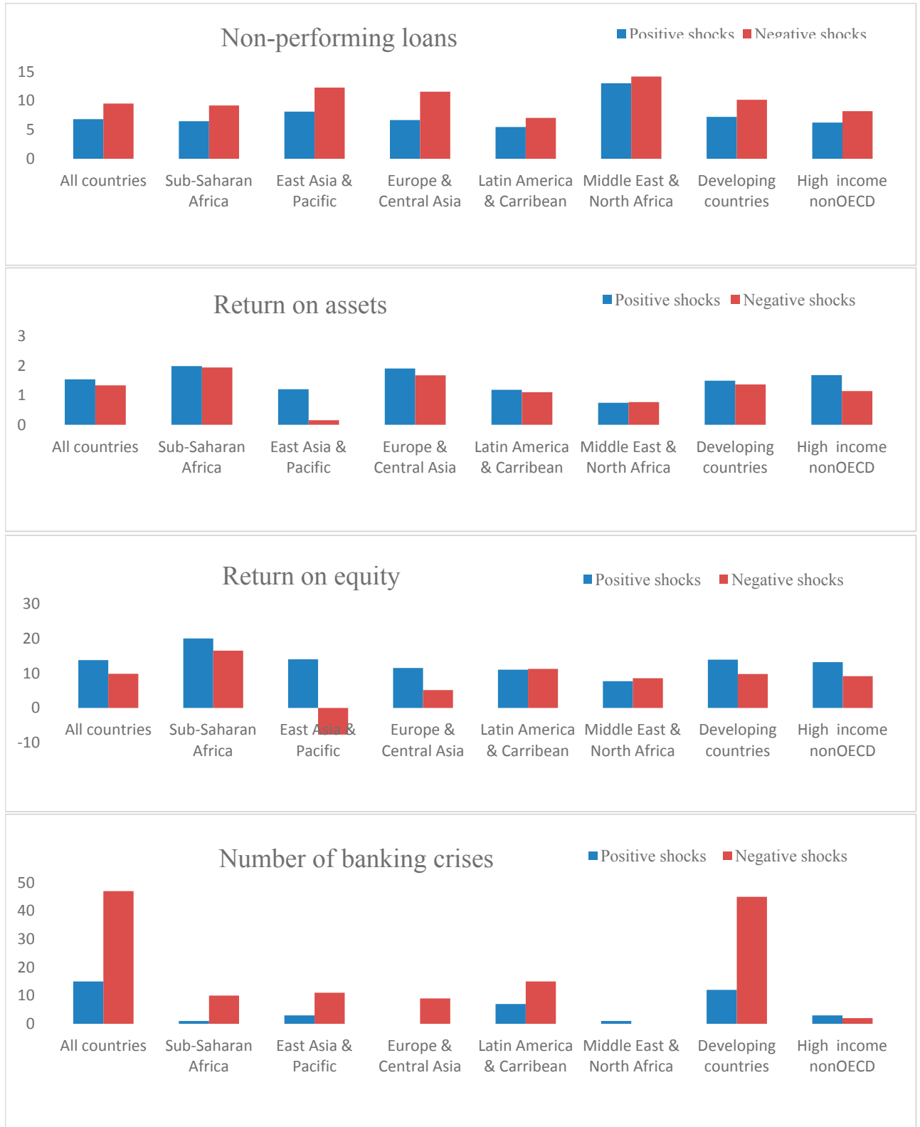
Figure 3. Financial Fragility during Positive and Negative Shocks